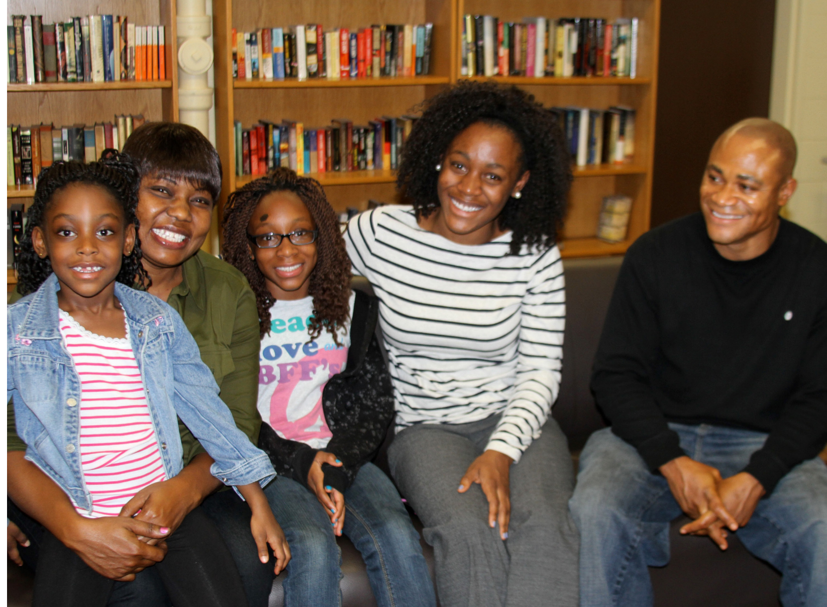
"We really appreciate living here and all of the support that we get." - The Ebong Family