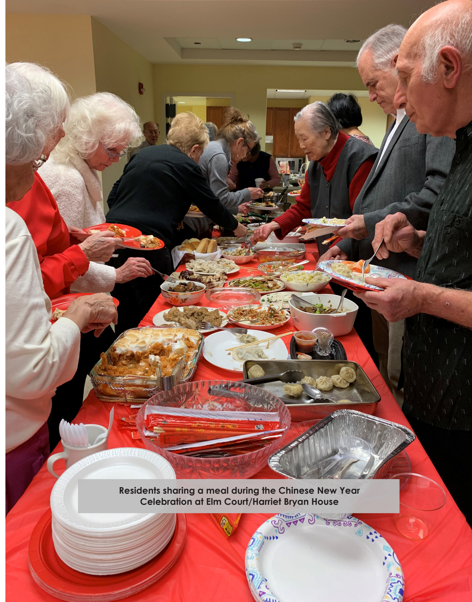
Residents sharing a meal during the Chinese New Year Celebration at Elm Court/Harriet Bryan House